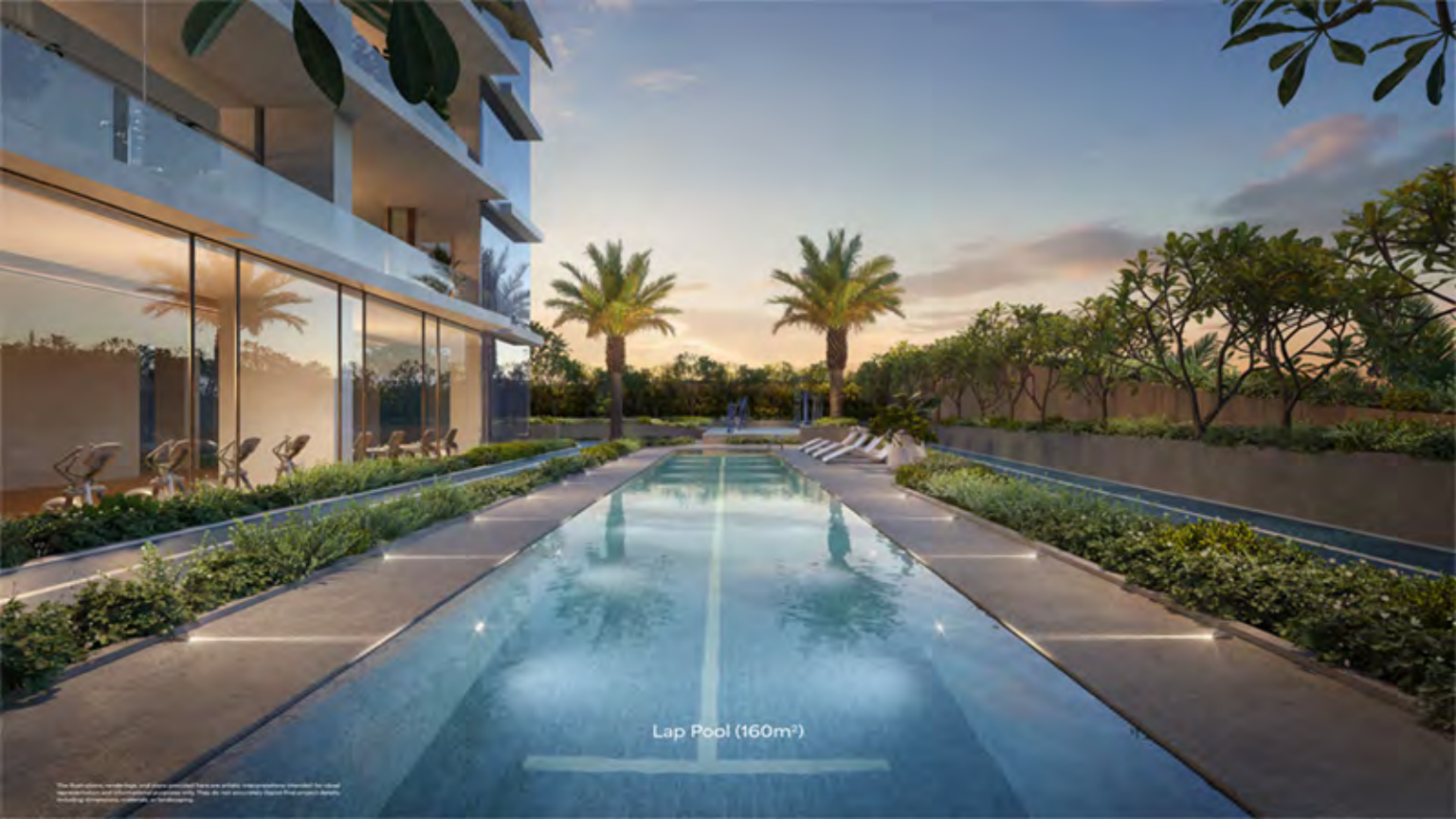
Lap Pool (160m 2 )