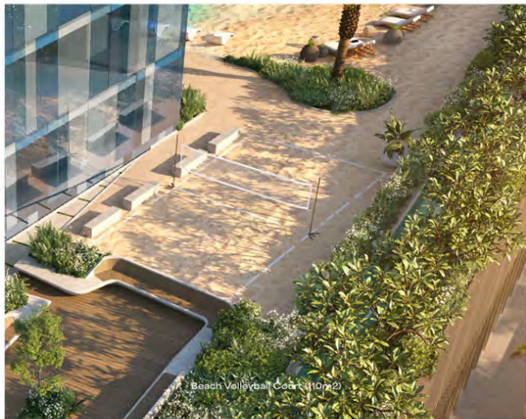
Beach Volleyball Court (110m 2 )

The features, finishes and sizes provided here are artist impressions intended for visual representation and informational purposes only. They do not necessarily reflect final product details, including dimensions, materials, or landscaping.