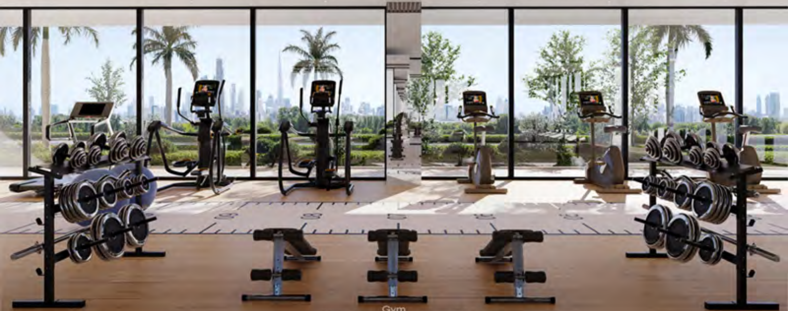
Gym Male (250m 2 ) Female (120m 2 )