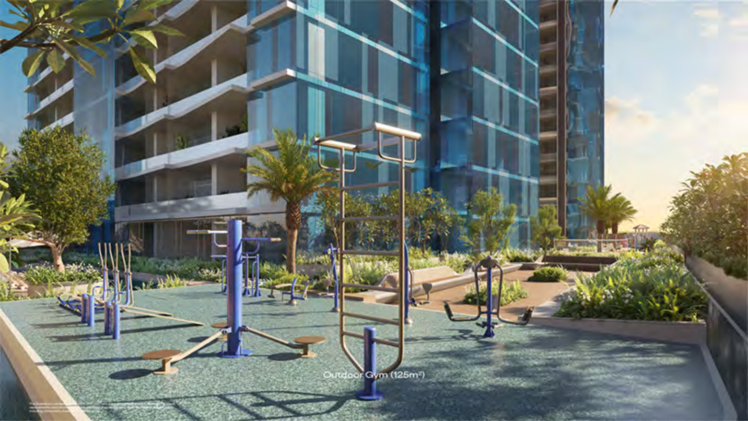
Outdoor Gym (125m 2 )