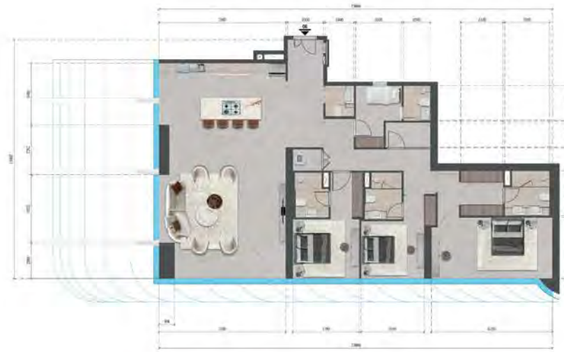
74th floor APT06 Type 3BR