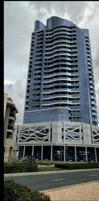
Blue Waves Tower