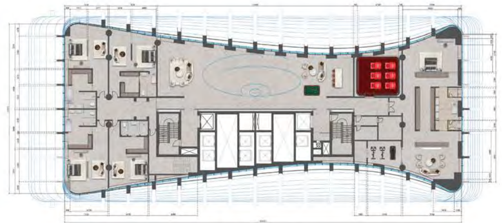
105th Floor Plan