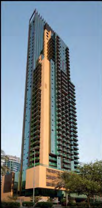
The Square Tower