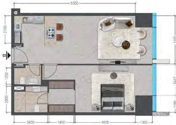
1st-6th & 8th-32nd & 34th-54th APT03 Type 1BR