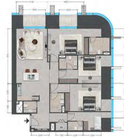
1st-6th & 8th-32nd & 34th-54th APT04 Type 3BR