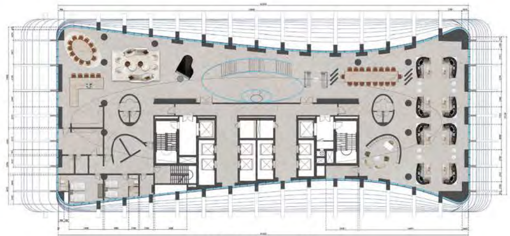
104th Floor Plan