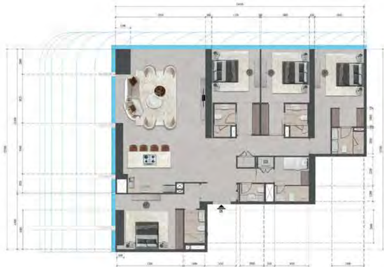
74th floor APT05 Type 4BR