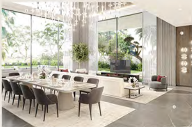
FAMILY AREA & SHOW KITCHEN